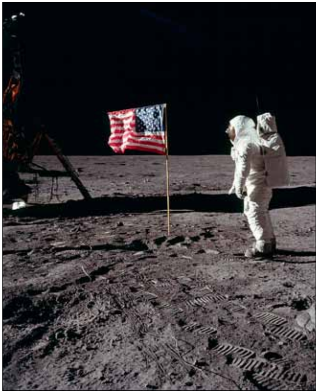
Edwin “Buzz” Aldrin salutes the flag planted on the moon during the Apollo 11 mission that landed on the moon on July 20, 1969.