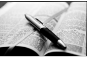
JUST A THOUGHT

I thank God for the blessings That His mercy has bestowed I'm drinking from the saucer 'Cause my cup has over-