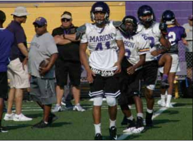
The Marion Giants hosted a 90-minute football scrimmage last week.