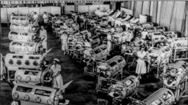
A polio ward filled with patients in iron lungs in the 1950s.