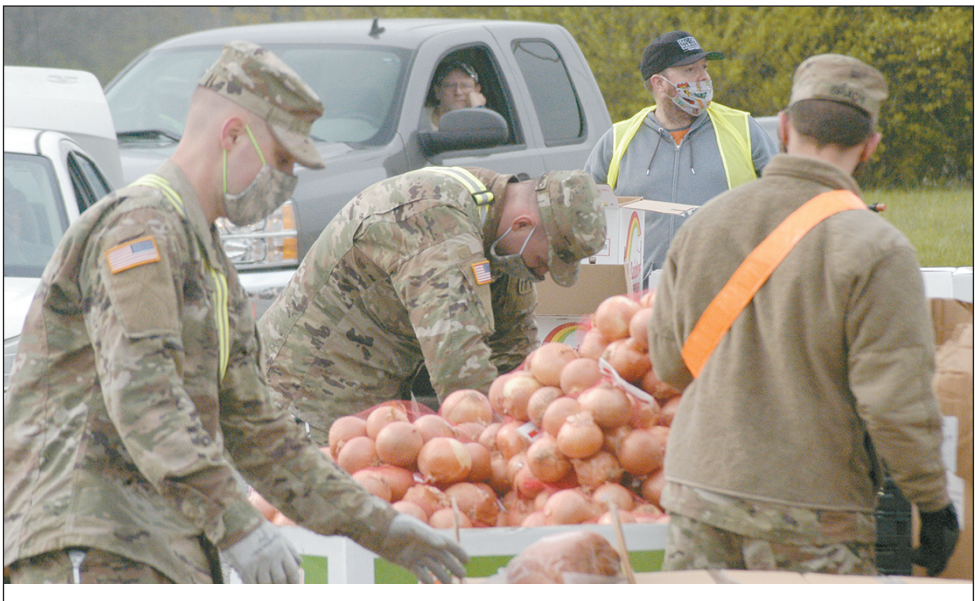
Members of the National Guard help unload food for the Second Food Harvest Bank.