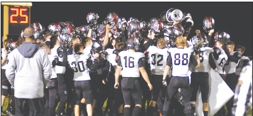
Panthers celebrate clinching the outright CIC championship after their triumph over Madison-Grant.

think that is absolutely the case with this group. The growth that they showed and the maturity that they showed is really phenomenal. I love them so much, and I couldn't be prouder." Oak Hill ends the season with a 17-2-1 record.