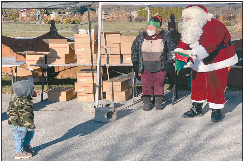
Photo on left: A member of Miller’s Merry Manor handed out donuts and other goodies on Saturday morning at Matter Park. Photo above: One youngster made sure to still tell Santa what he wants for Christmas.