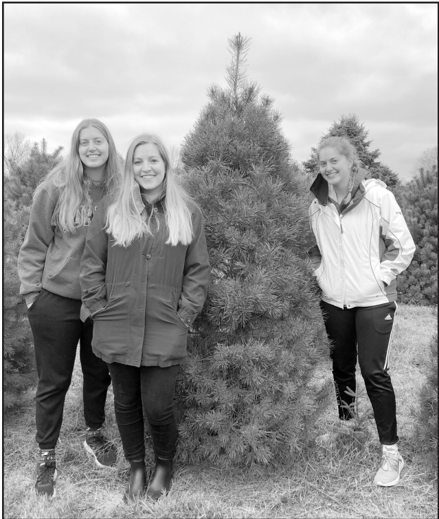
The Wilk girls pose with the 2020 Chirstmas tree..

It was festive for Larry and I go to the local tree farm those pre-children