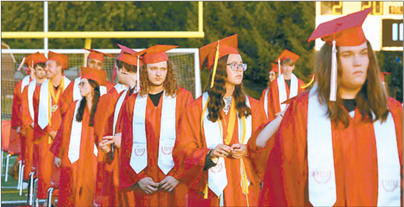
Mississinewa 2020 seniors celebrated their graduation at Fisher Field.