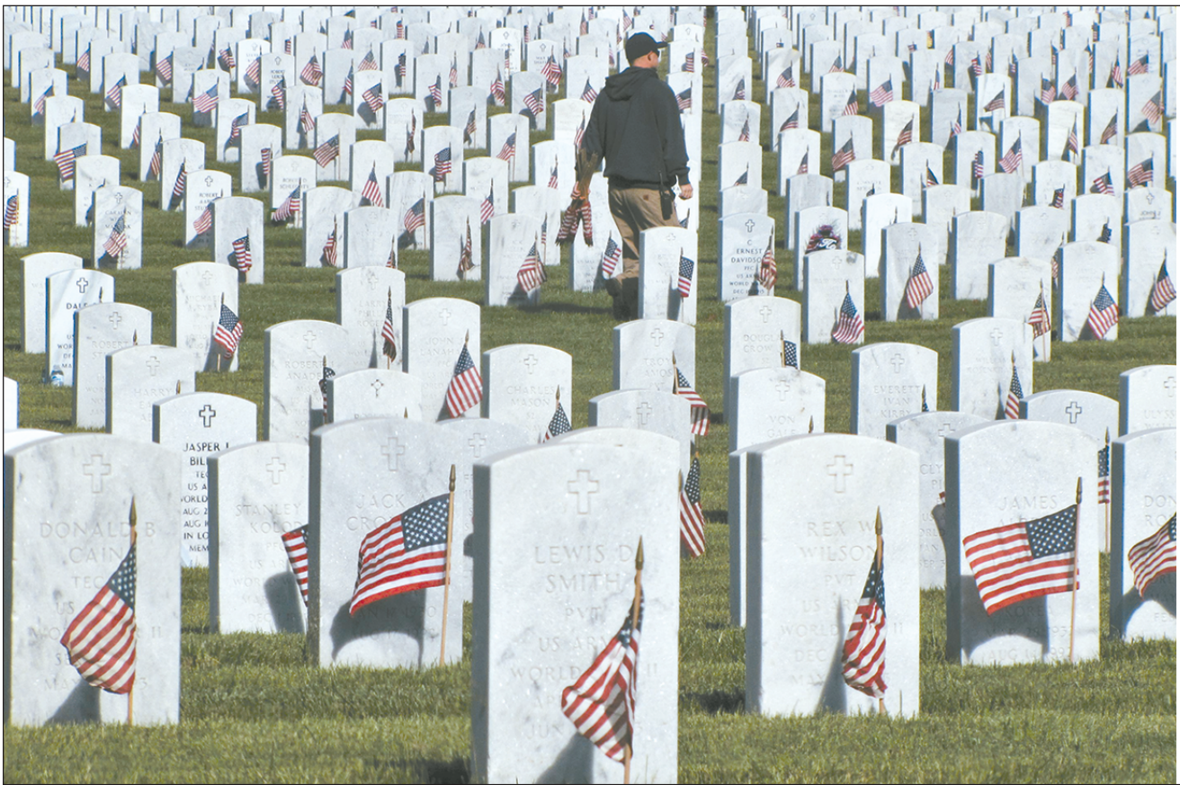
A volunteer strolls among the graves at the Marion National Cemetery, looking for graves that still need an American flag placed upon it.

We call it Memorial Day today, a three-day national holiday weekend that marks the start of the summer season and, of course the Indy 500 here in Indiana. But it began as Decoration Day in those dark days of the American Civil War, a day set aside in spring to place flowers and memorials on the graves of those thousands of Americans who had recently died. That tradition continues at some cemeteries across the country, particularly the 155 National Cemeteries scattered across 44 states. Among them is the Marion National Cemetery, laid out on the 61-acre rolling landscape east of the Marion