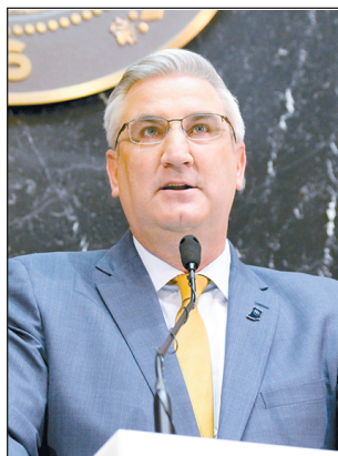
Gov. Eric Holcomb

"I'm honored to recognize these dedicated, Hoosier business leaders who have created a lasting impact not only on their communities but to the state as a whole," said Gov. Holcomb. "As we continue to attract new jobs and investment to Indiana, these well-established businesses will set the tone for a Hoosier economy dedicated to hard work, constant improvement and strong community roots. I'm confident these businesses will continue providing great service for the next 100 years and keep Indiana on the path to success for centuries to come." The Governor's Century and Half Century Business Awards honor Hoosier businesses that